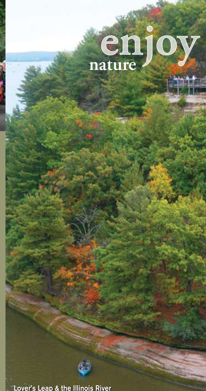
Lover's Leap & the Illinois River