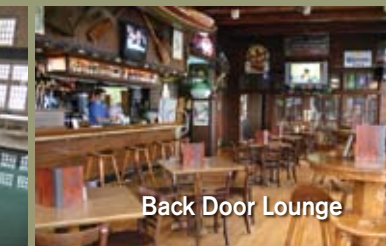
Back Door Lounge