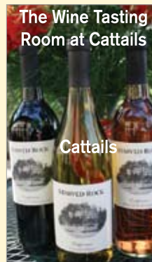
The Wine Tasting Room at Cattails