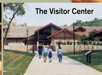
The Visitor Center