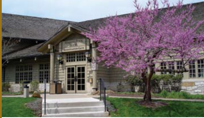
Starved Rock Lodge & Conference Center

Starved Rock State Park is what makes the Lodge magical! Its sparkling waterfalls and 18 majestic canyons, carved by years of glacial meltwater, slice dramatically through tree-covered sandstone bluffs. Recently named one of the 7 Wonders of Illinois, the Park offers visitors both adventure and tranquility.