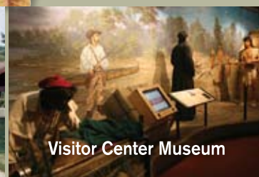
Visitor Center Museum